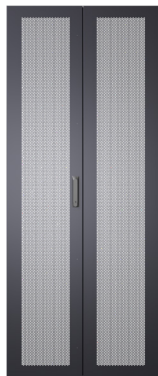
Double Perforated Door