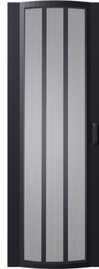
Single Curved Perforated Door