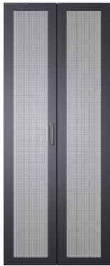
Double Perforated Door