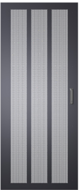
Single Perforated Door