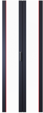
Double Glass Door