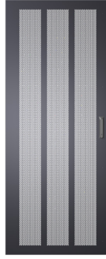
Single Perforated Door