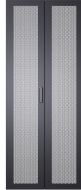
Double Perforated Door