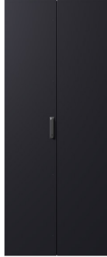
Double Solid Metal Door