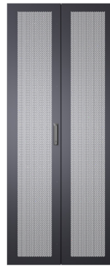
Double Perforated Door