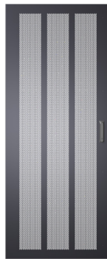
Single Perforated Door