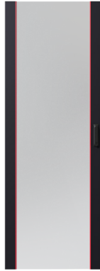
Single Glass Door